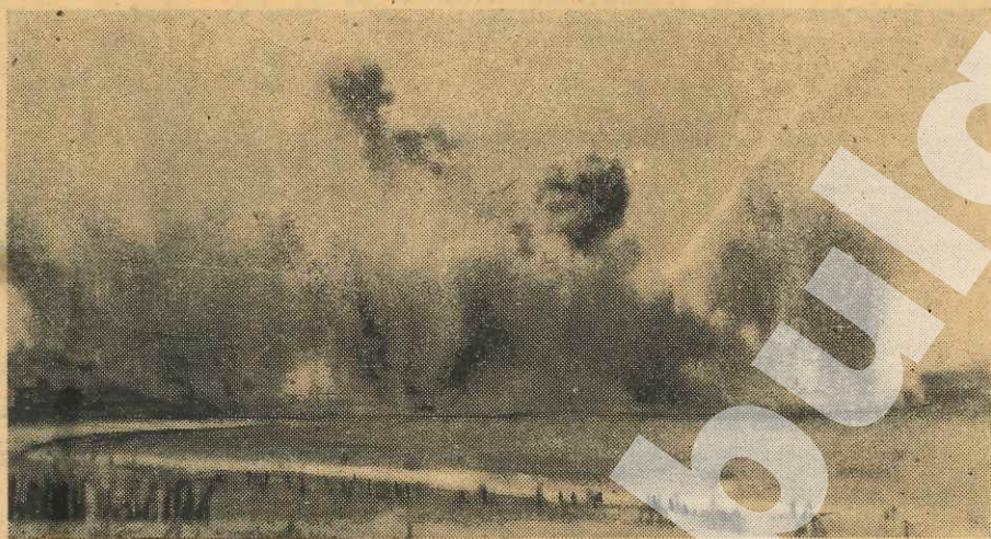
The impregnability of a German fortified stronghold is softened with bombs prior to an infantry attack.