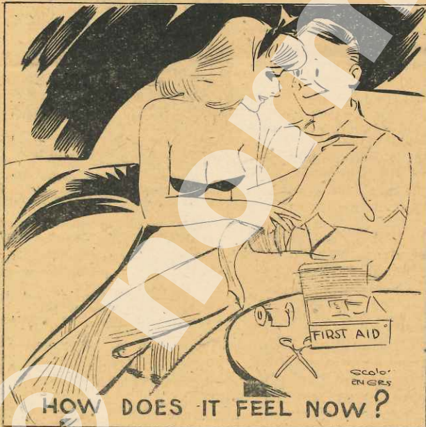
HOW DOES IT FEEL NOW?

Since you are now included among our readers, we'll welcome your suggestions.